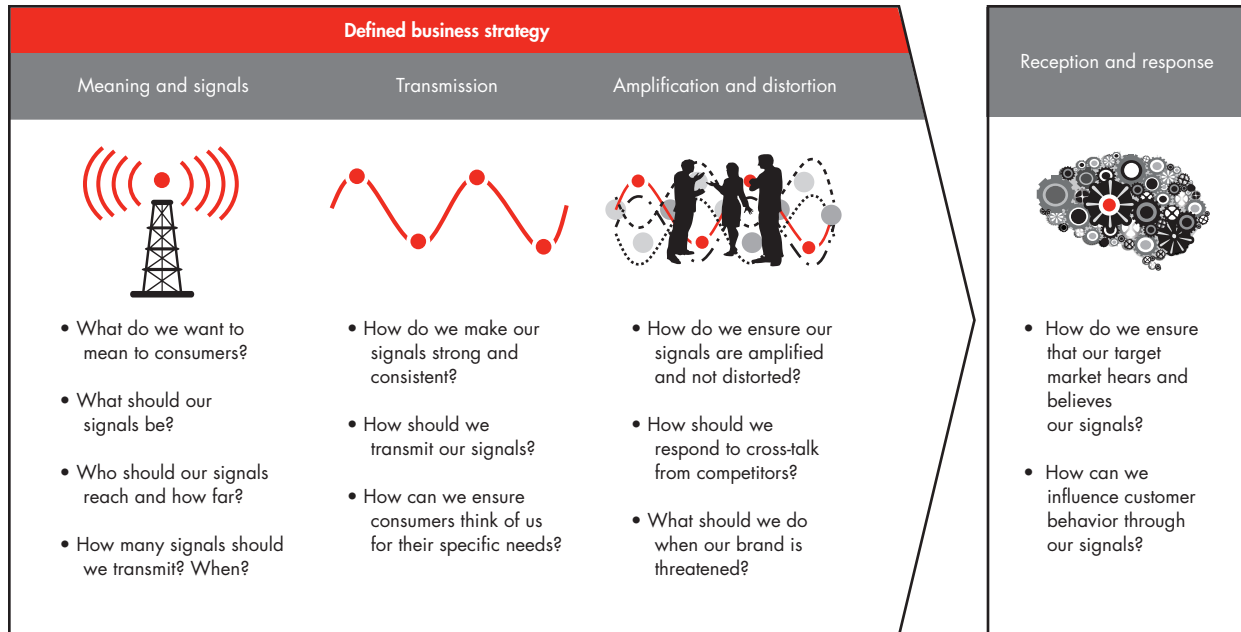
Figure 2: An effective brand strategy manages three stages of customer interaction to shape customer response