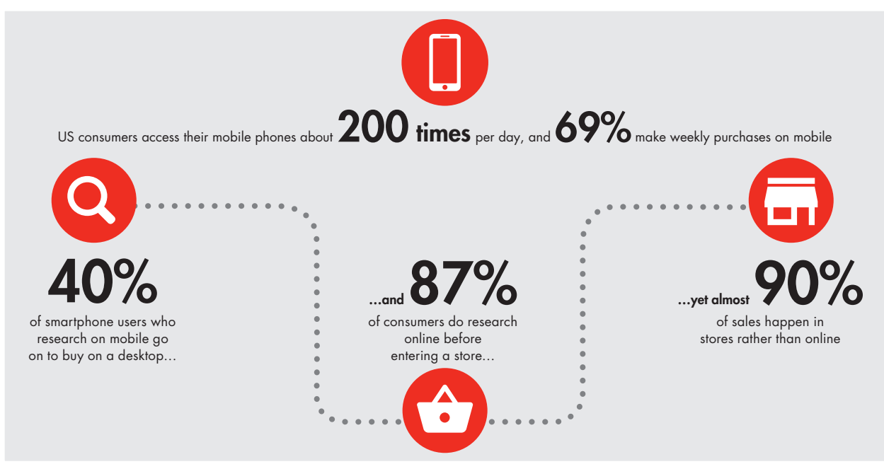
Sources: Bain & Company US consumer survey, September 2016 (n=5,853); Google Micro-Moments report; US Census Bureau