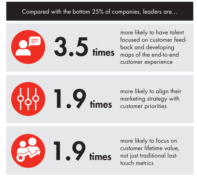
Notes: Priorities refer to those set by the customer; leaders (the top 20% of companies) and the bottom 25% are ranked according to a composite index of market share percentage change and revenue percentage change from 2014 through 2015

Figure 1 : Marketing leaders put their customers' priorities first