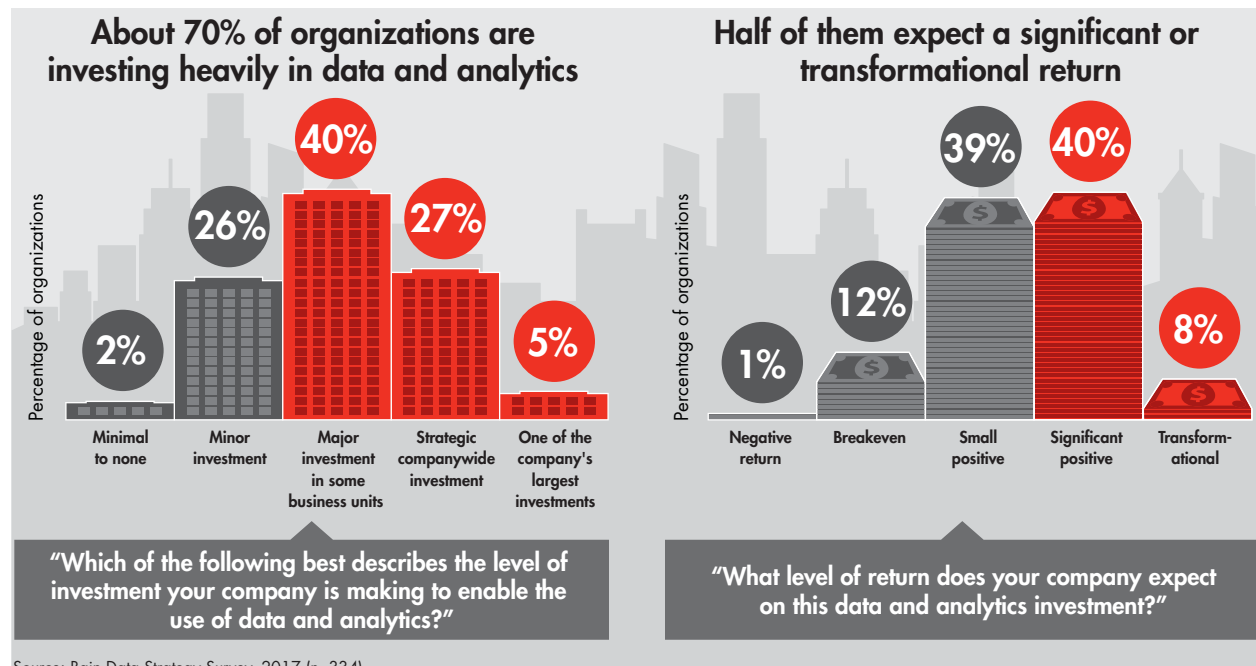
Figure 1: Companies are making substantial investments in data and analytics, and expect large returns

These success stories leave late adopters wondering what big steps they can take to catch up. Many will rush to invest in the latest analytics software and infrastructure vendors and hire data scientists, but the ultimate winners will align these investments with their